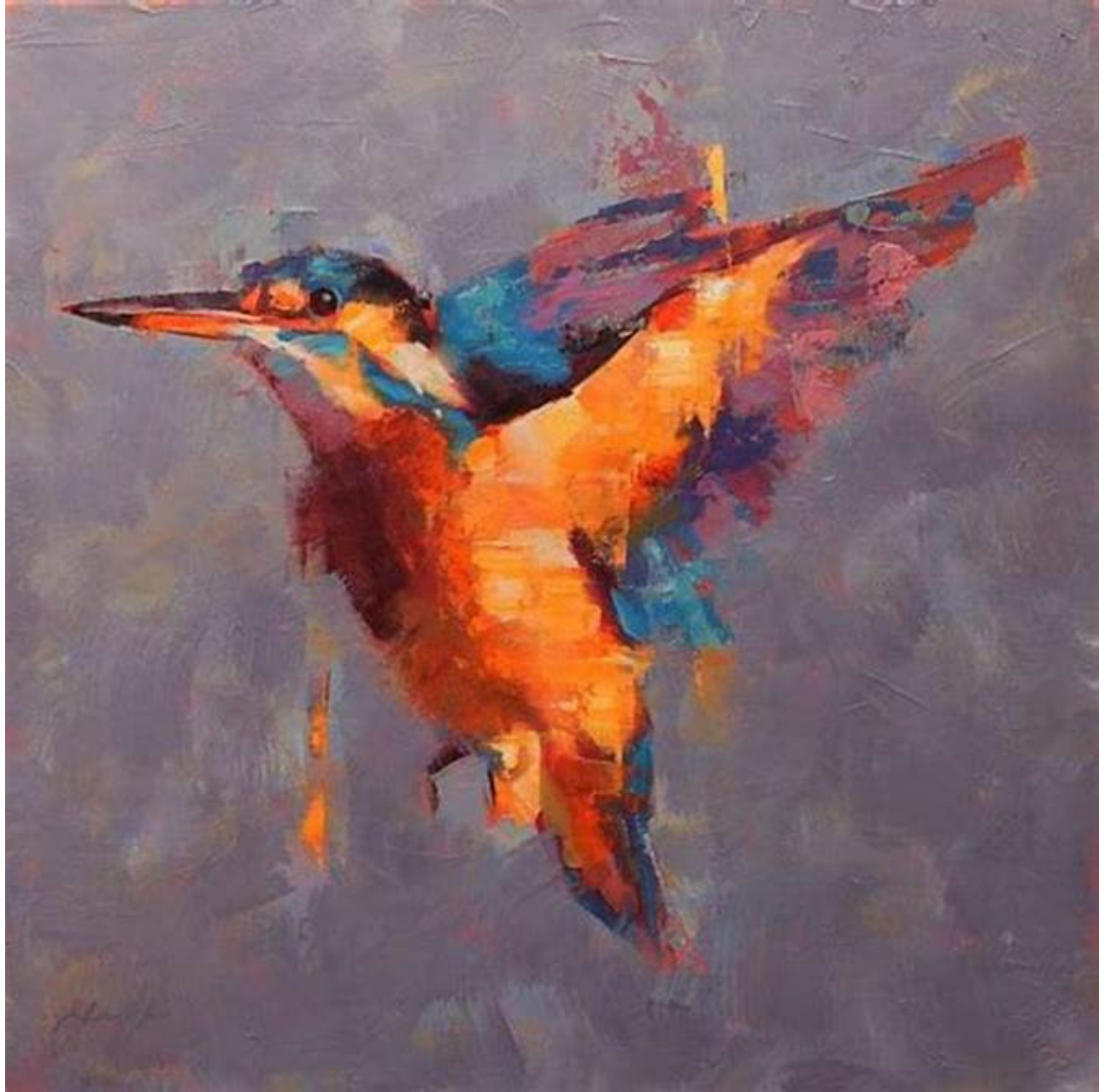
Joan Miró, The Bird-Flight , 1952

In Joan Miró's abstract masterpiece, The Bird-Flight , time is expressed through the dynamic interplay of lines, shapes, and colors. The painting conveys the sensation of flight, evoking the transience of moments and the cyclical nature of life. Miró's use of vibrant colors and sweeping