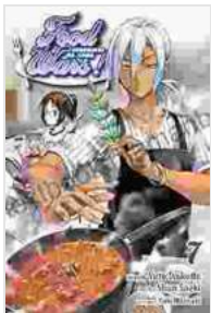
Image 5: Soma Yukihiro facing off against the Wolf Pack in a cooking competition.

Image 4: Takumi Aldini slicing ingredients with his sword in the kitchen.