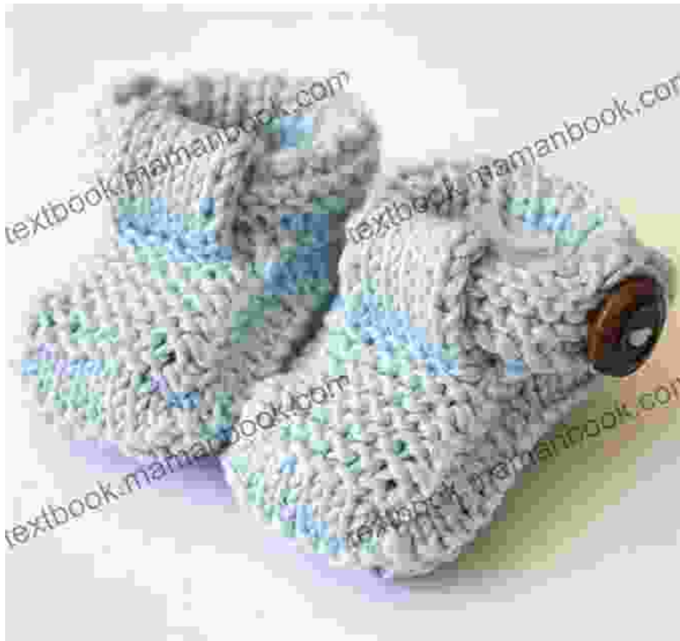
Intricate knitting patterns create a beautiful and stylish design