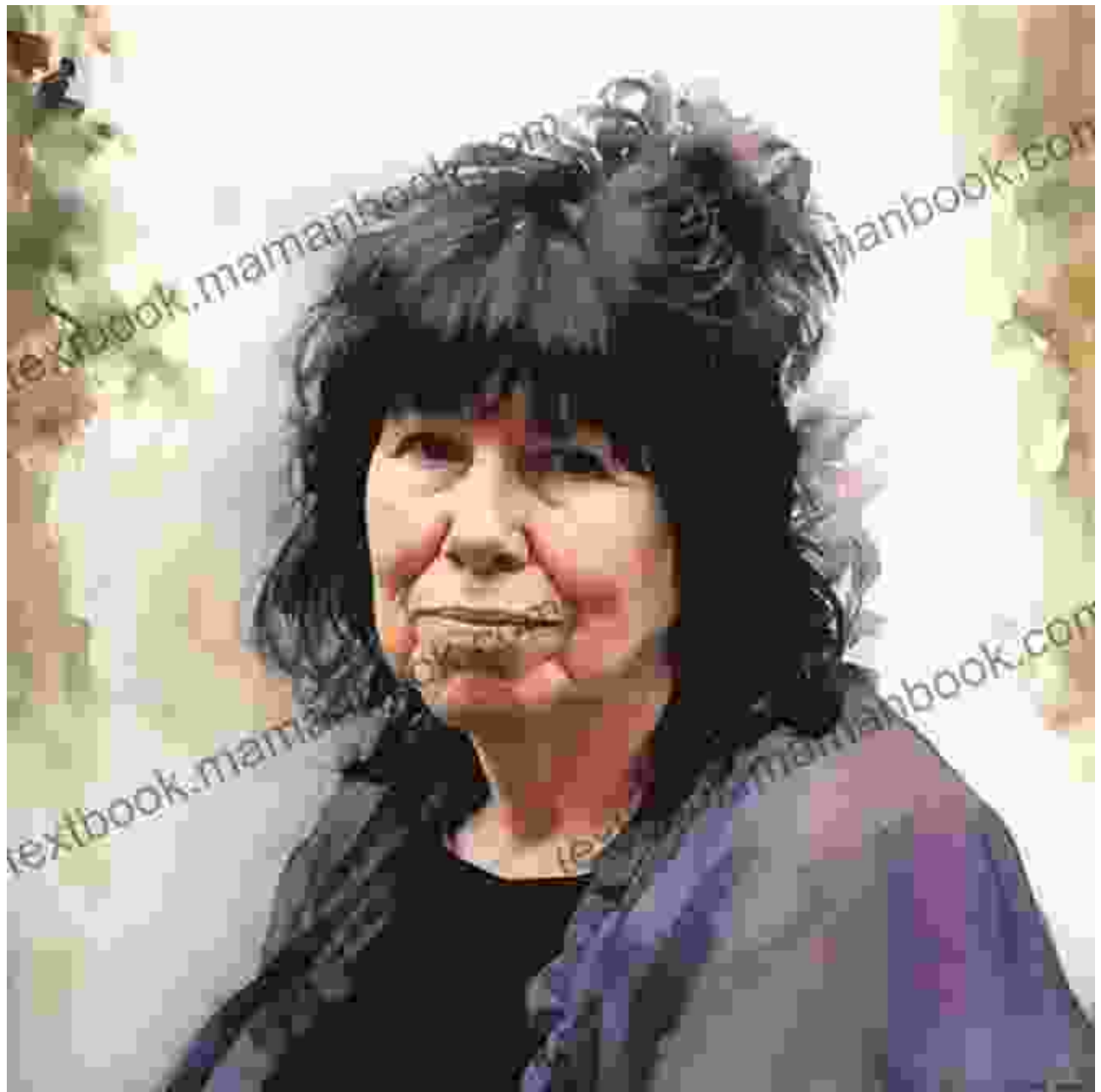
Marge Piercy, the author of "Made in Detroit."

Piercy's personal experiences in Detroit deeply influenced the themes and perspectives of "Made in Detroit." Born in Detroit, she spent her formative years in the city and witnessed firsthand the social and economic transformations it underwent.